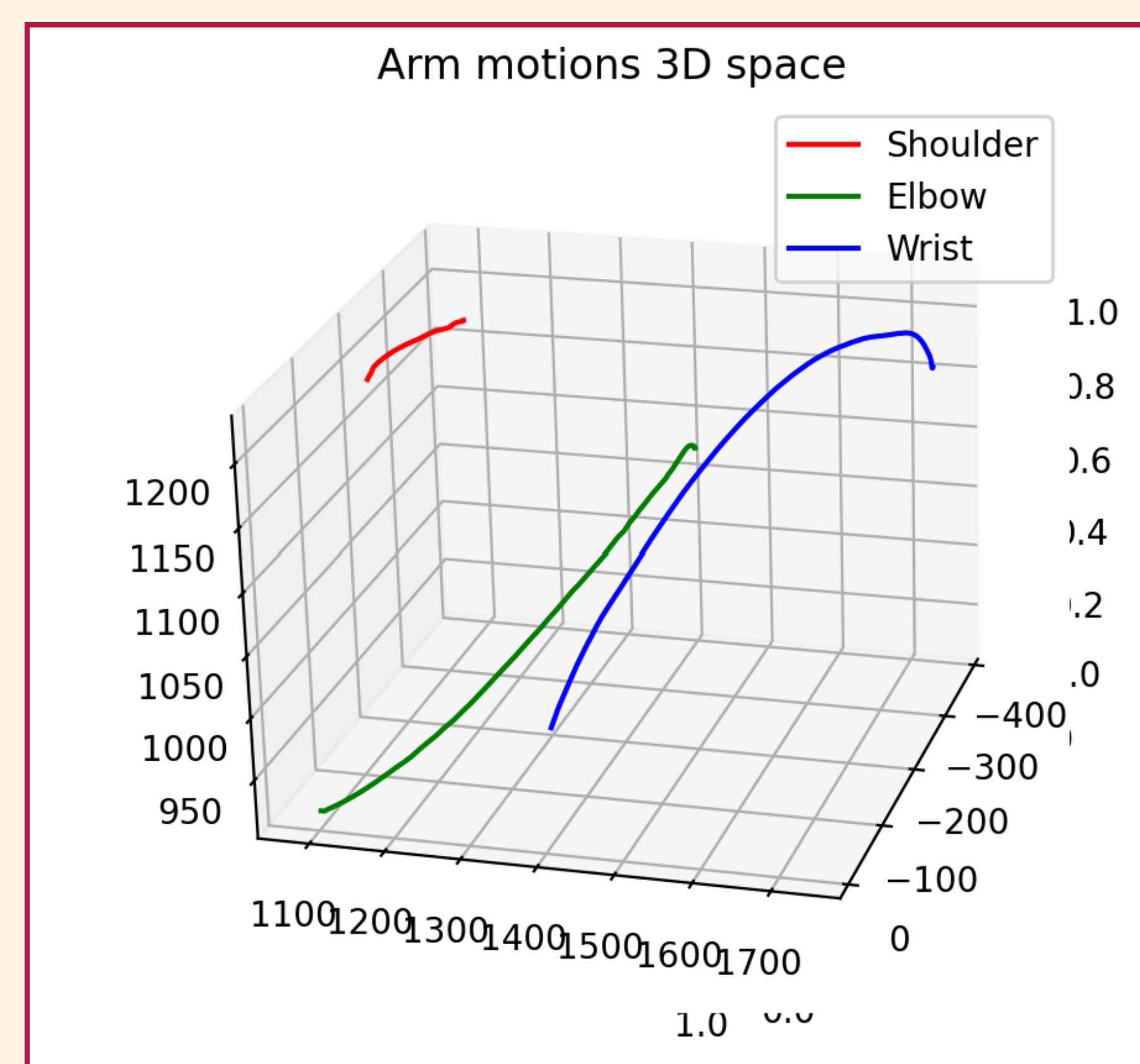
Figure 1) 3D graph of all 3 joint coordinates during movement.